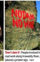
Don't dam it: People involved in road work along Irrawaddy River; (above) a protest sign. <w>

rawaddy River, the mythic cradle of civilisation for Myanmar's ethnic Burman majority.